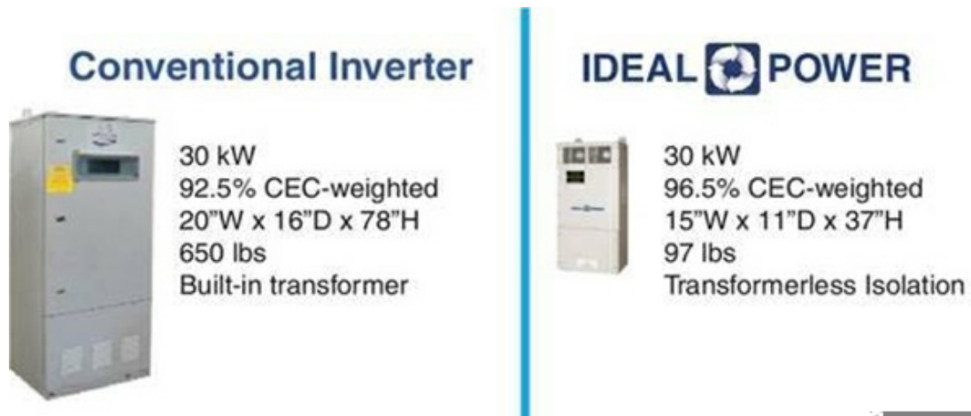
Figure 2 illustrates these advantages: